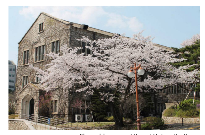
Cherry blossoms at Yonsei University, Korea

"Living in the dorm was fun. Being in a community of international students was the best part."