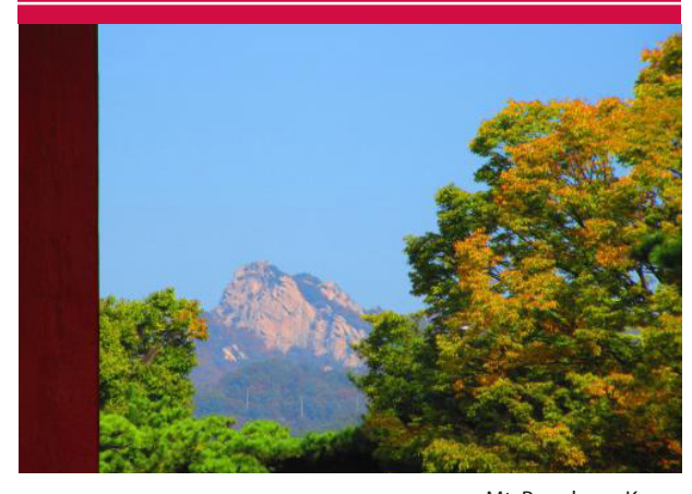
Mt. Bugaksan, Korea

Spend a semester in Seoul, the political, economic, and educational center of Korea. You can live and study in a city where traditional temples and palaces coexist with modern high-rise buildings. Yonsei University is filled with people from all over the world and is one of the most prestigious universities in Korea, comparable to Harvard or Oxford. No matter what you like to do, you can find it in Korea: shopping, eating, hiking, karaoke, museums, visit the demilitarized zone, and much more.