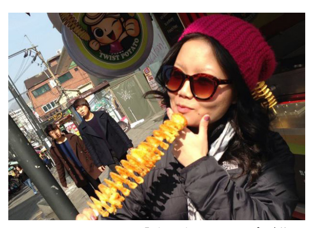
Eating twist potato street food, Korea