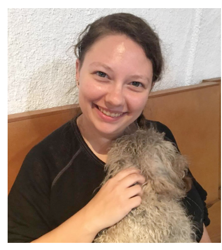
Dog cafe, Sinchon, Korea

With 25,000 undergraduates, Yonsei's student body is comprised of the top 1% of high school graduates in Korea, and is proud of its long history as the leading private institution of higher education in Korea, as well as its reputation as the most internationalized university in Korea, having the most extensive network of exchange partners from around the world.