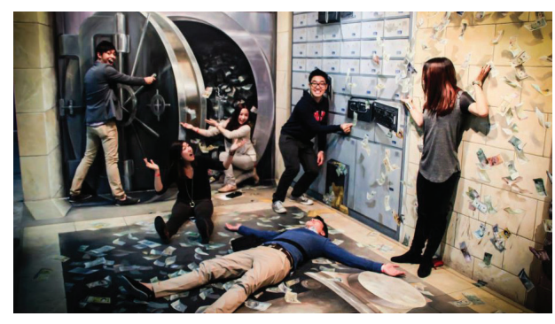
Trickeye museum, Hongdae, Korea

To find more clubs at Yonsei, visit: http://www.yonsei.ac.kr/eng/campus/clubs/