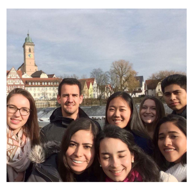
Exploring Nürtingen, Germany

Applications are available only online: https://inside.linfield.edu/_files/ipo/application-study-abroad.pdf