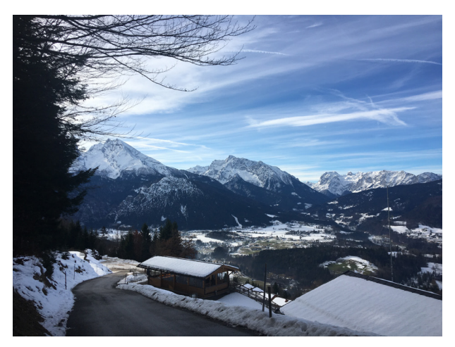
Berchtesgaden Alps, Germany