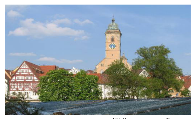
Nürtingen campus, Germany

Spend a semester or year in Germany, a landmark of economic, political, and social innovations. There are two potential locations for students. Nürtingen-Geislingen University (HFWU) has two campuses as the name suggests: one in Nürtingen and the other in Geislingen, about 40 minutes apart from each other. The campus will be chosen for the student depending on the area of study or major of the participant.