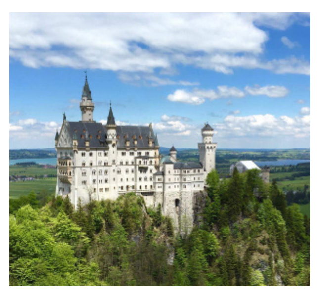
Neuschwanstein Castle, Germany