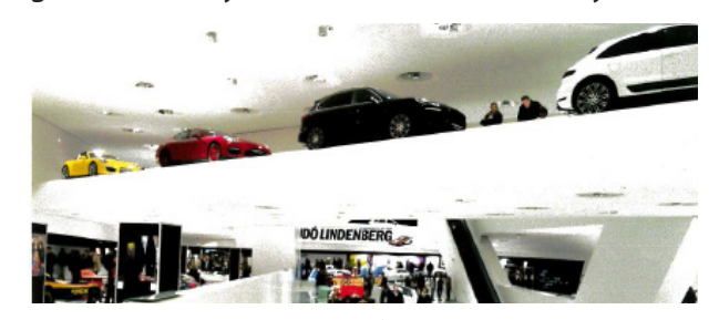
Mercedes Museum. Stuttgart, Germany.

There are more than 50 courses at the Nürtingen campus taught in English, and most have a business focus: marketing, finance and accounting, international business and management, economics, international management and organizational behavior, and German language and culture. Furthermore, students benefit from activities such as organized excursions and a buddy system. The Geislingen campus offers a variety of courses, but all courses are taught in German, so the student must be proficient in the language. Fall semester runs from approximately Sept. - January; spring semester goes from early-March until the end of July.