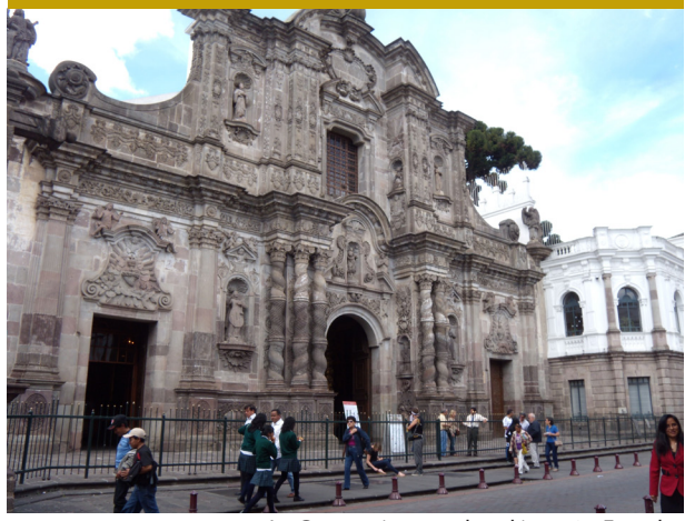
La Compania, completed in 1765, Ecuador

Linfield offers 2 academic programs through the Universidad San Francisco de Quito. One is at its main campus in Quito, with a wide variety of courses taught in Spanish for Spanish language students. The other program is in the Galapagos Islands where courses taught in English focus on biology, ecology, marine and environmental sciences. In both programs, organized field trips and cultural activities supplement coursework and students stay with local host families.