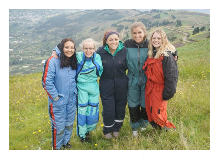
Students in Baños, Ecuador

The Galapagos Academic Institute for the Arts and Sciences (GAIAS) is situated in a newly renovated airy and spacious facility of USFQ overlooking the bay of Puerto Baquerizo Moreno, the capital city of the Galapagos Archipelago on the island of San Cristobal. Even though instruction at the institute is in English, one year of Spanish is required for participants so that they can appreciate the local community more fully and engage in cultural activities. GAIAS offers full-semester programs in English in the biological and social sciences. Upon arrival, students will study at the USFQ's main campus in Quito where they will take their first module. They then spend the remainder of the semester completing four modules at the GAIAS campus on the Island of San Cristobal, Galapagos.