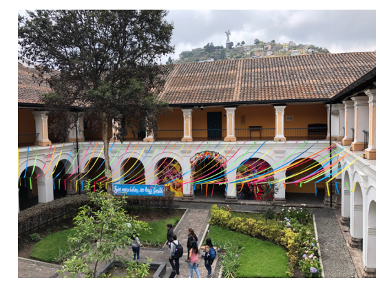
Museo de la Cuidad, Ouito, Ecuador

Each track consists of 5 intensive 3-credit courses taught in 3-week modules.