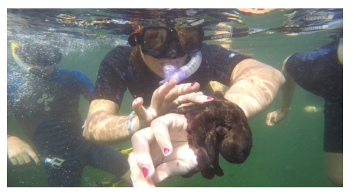
Petting an octopus while snorkeling, Ecuador

Linfield offers 2 academic programs through the Universidad San Francisco de Quito. One is at its main campus in Quito, with a wide variety of courses taught in Spanish for Spanish language students. The other program is in the Galapagos Islands where courses taught in English focus on biology, ecology, marine and environmental sciences. In both programs, organized field trips and cultural activities supplement coursework and students stay with local host families.