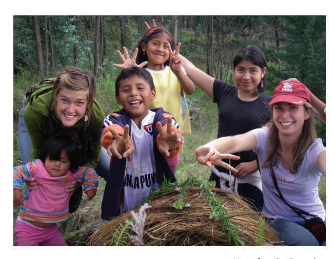
Host family, Ecuador

Students commute on public transportation from their homestay to the University. By US standards, the cost is inexpensive.