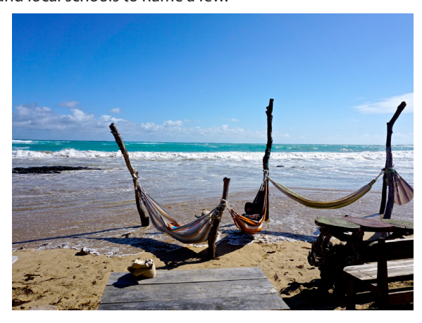
Hammocks at a restaurant on Isabela island, Galapagos, Ecuador

There are opportunities for students to participate in community service, such as pest control, waste management, introduced species control, day care centers and local schools to name a few.