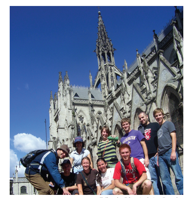
Tallest building in Quito, Ecuador