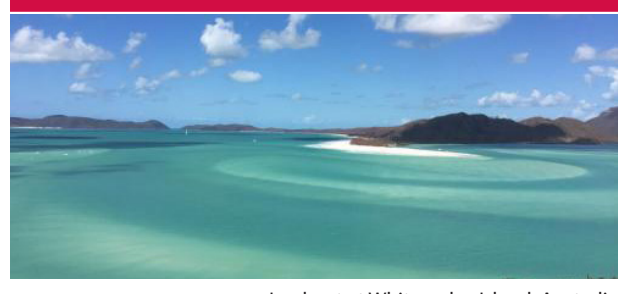
Lookout at Whitsunday Island, Australia

Walk the rainforest and snorkel the Great Barrier Reef! Australia's natural beauty is talked about worldwide. This ancient land is geologically one of the oldest on earth. The world's largest island and the only nation to occupy an entire continent, Australia is the size of the USA, yet has only 20 million people.