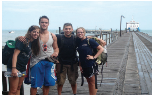
Hiking the world's largest sand island, Australia

Located in the state of Victoria on the southeastern tip of Australia, Deakin University offers three different campuses for study opportunities. Students may enroll in a wide variety of regular university courses in liberal arts, architecture, business, education, fisheries & wildlife, nutrition, exercise & sports science, mechanical engineering, construction engineering, and more. Deakin University is one of Australia's most progressive universities, and has twice won the prestigious University of the Year award.