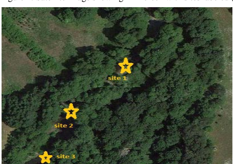
Figure 4: Satellite image showing Mill creek with sites labeled (Google, 2012).

Mill Creek was sampled just upstream from where Gooseneck Creek empties into it. Mill Creek is very close to Gooseneck and has similar land surrounding it, mostly agricultural fields and pasture land for dairy cows. There is more vegetation and tall trees providing shade along the creek than at Gooseneck. There are pools and riffles which create a winding creek. Figure 4 shows the sample sites used along Mill Creek in fall 2012 from an aerial view.