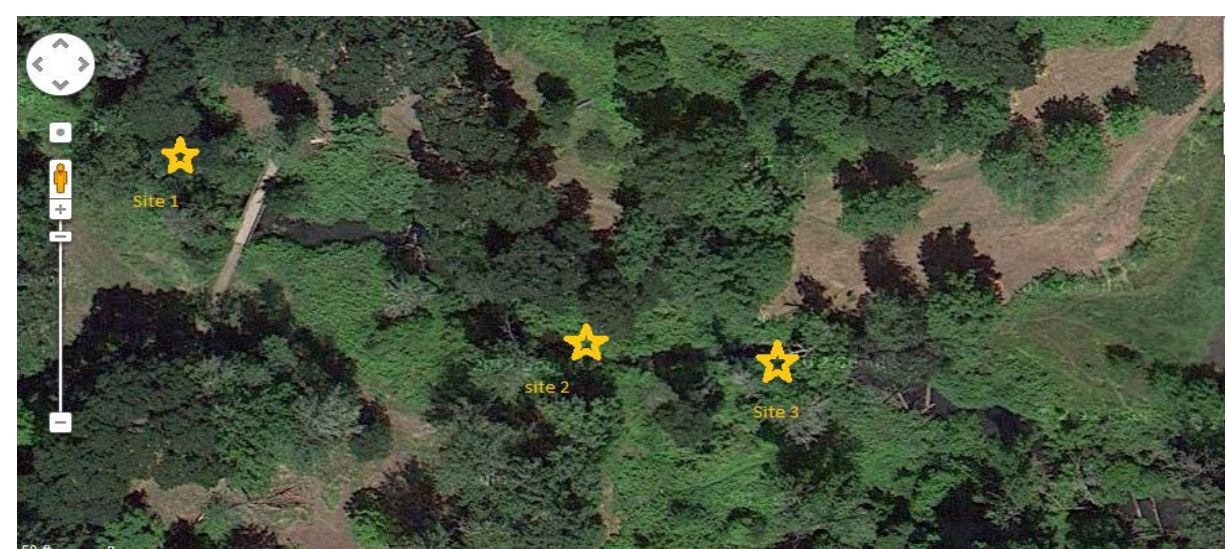
Figure 2: Satellite image showing Cozine creek with sites used in fall 2012 labeled. (Google, 2012).

Gooseneck Creek was sampled in the area where the Greater Yamhill Watershed Council had done the previously mentioned restoration project in 2009. This site is a short distance upstream from where the creek flows into Mill Creek. The area around Gooseneck is rural, mostly for agricultural uses. Gooseneck creek has small pools due to weirs as well as a lot of thick vegetation along its banks. Figure 3 shows an aerial picture of the section of Gooseneck Creek and the sites where samples were taken.