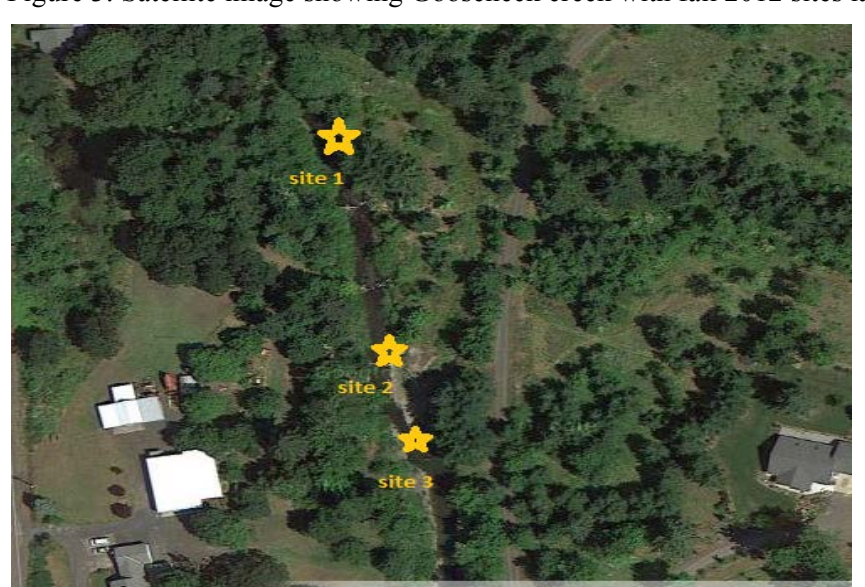
Figure 3: Satellite image showing Gooseneck creek with fall 2012 sites labeled (Google, 2012).

Gooseneck Creek was sampled in the area where the Greater Yamhill Watershed Council had done the previously mentioned restoration project in 2009. This site is a short distance upstream from where the creek flows into Mill Creek. The area around Gooseneck is rural, mostly for agricultural uses. Gooseneck creek has small pools due to weirs as well as a lot of thick vegetation along its banks. Figure 3 shows an aerial picture of the section of Gooseneck Creek and the sites where samples were taken.