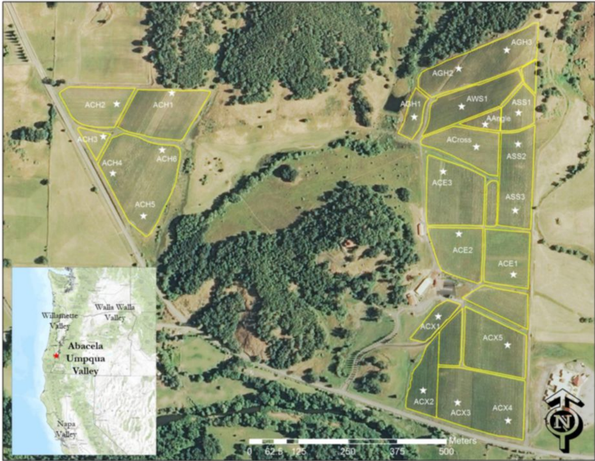
Figure 1: Abacela Winery and Fault Line Vineyard temperature sensor network (acronyms are based on the block name and are the same as in Table 1). Inset show the location of the vineyard relative to other west coast regions and the Umpqua Valley AVA.