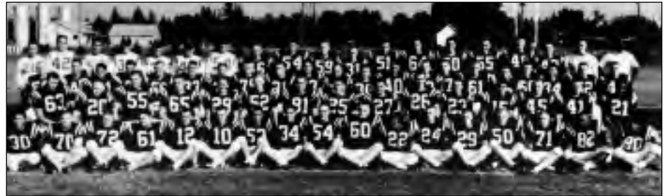
1961 Camellia Bowl Football Team