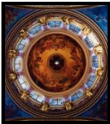
1st Place: "Dome at St. Isaac's Cathedral" Russia January 2009