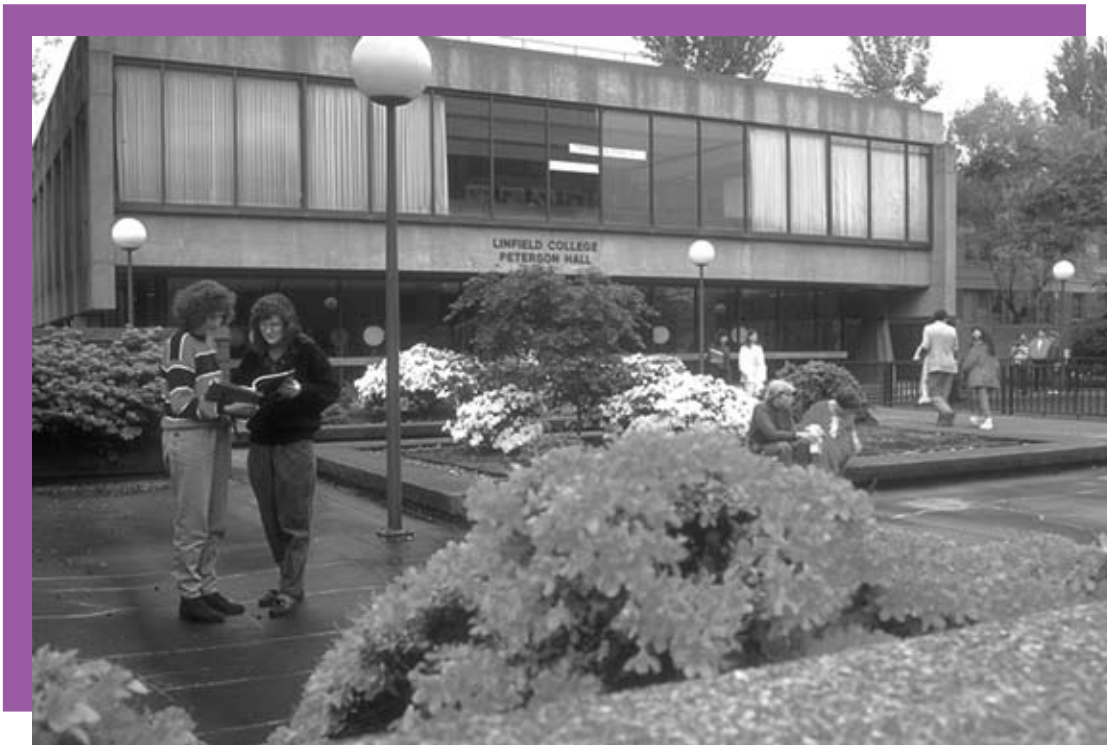
Peterson Hall, Portland Campus

*Peterson or Loveridge = Linfield/Portland Campus, 2255 NW Northrup St., Portland, OR 97210 See page 3 for textbook information.