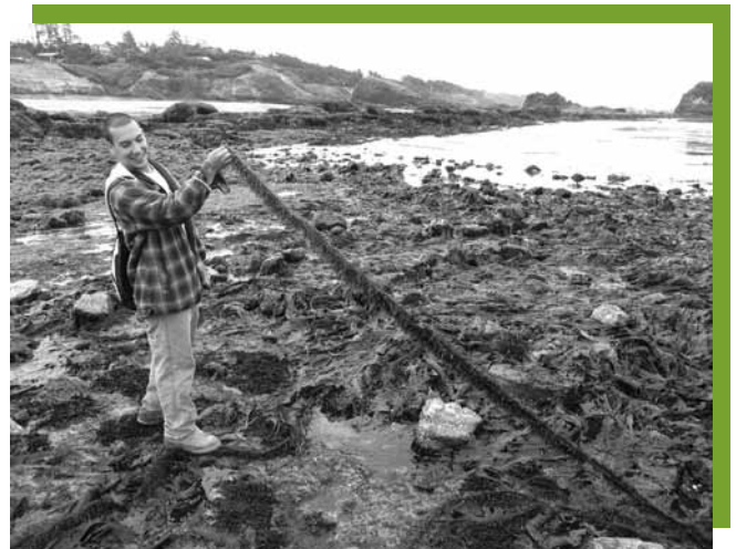
ENVS 302 Shoreline Ecology