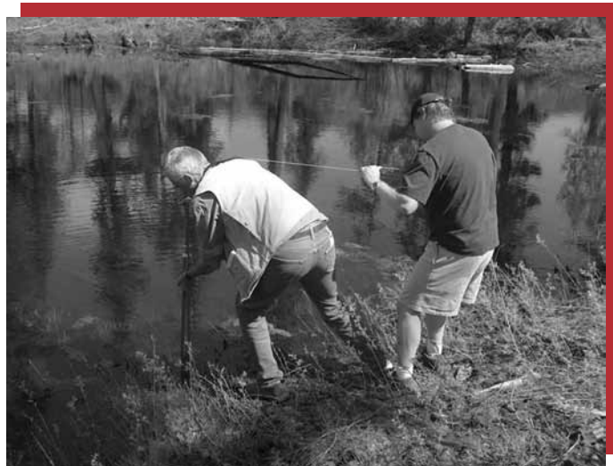
ENVS 306 Fire History of the Cascades

Weekend backpack in the Oregon Cascades. Fee includes travel, food and permits. 2 credits.