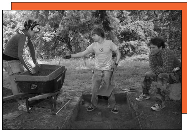
ANTH 326 Archaeological Field Methods