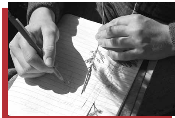
ENVS 302 Shoreline Ecology